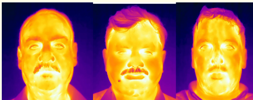
Figure 2: Patient 1

In another example, the moderate-risk individual studied (B) is also a male, 65 years old with hypertension (7 years), type-2 diabetes (25 years; HbA1c: 6.5%), hyper thyroid condition (5 years) and a smoker (12 years). Medications include, Olsertain, Gucoril, Famcid, Thyrox, Moxavas, Ecospirin, Istamet, Trika, Remylein, Crevast and Mirtaz. Risk score for this individual from IHRA, is as follows: DM 4.2, HTN 3.5 and LP: 3.1. Despite robust management of the diabetes in the moderate-risk individual, we see early signs of vascular dysfunction as evidenced by the thermal asymmetry and higher risk scores compared with the low-risk individual. Because of this fact, the moderate-risk individual should be referred to the appropriate specialists for further interventions to restore the blood flow to the affected areas. Given that this technique can detect subtle alterations in blood flow to various regions of the human body we have extended our studies to screen diabetic subjects as well as patients with hypothyroidism (Figure 2).